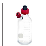
A00000410 Denitrification glass bottle