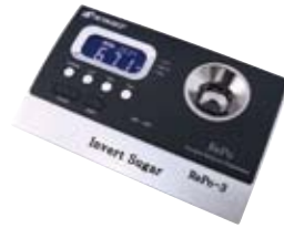
Inverted Sugar analysis model RePo-3