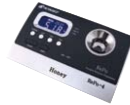
Honey analysis model RePo-4