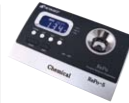
Chemical with nD result model RePo-5