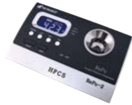
HFCS analysis model RePo-2