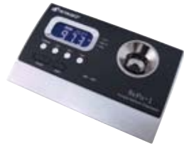
Sugar total analysis model RePo-1