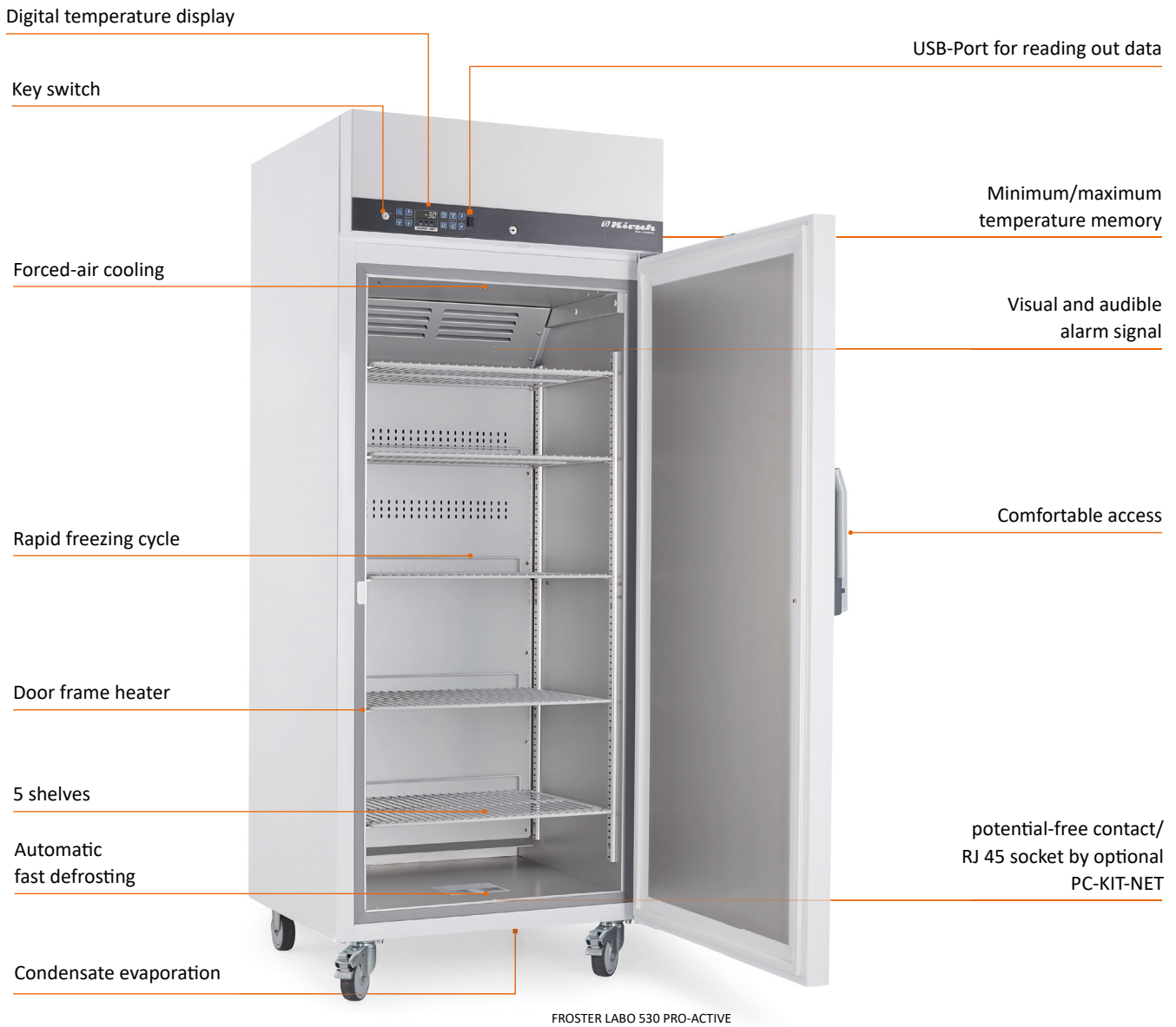
FROSTER LABO 530 PRO-ACTIVE