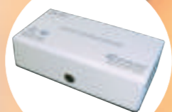
Convenient storage case

* External Light Interference (ELI) - Patent Pending When intense light penetrates the prism of a digital refractometer, the light waves interfere with the sensor resulting in inaccurate readings. The PAL series is equipped with ELI technology, which will display the warning message "nnn" if the ambient light is too intense. If the warning message is displayed, simply turn away from the light source or shade the prism with your hand and press the START key again.