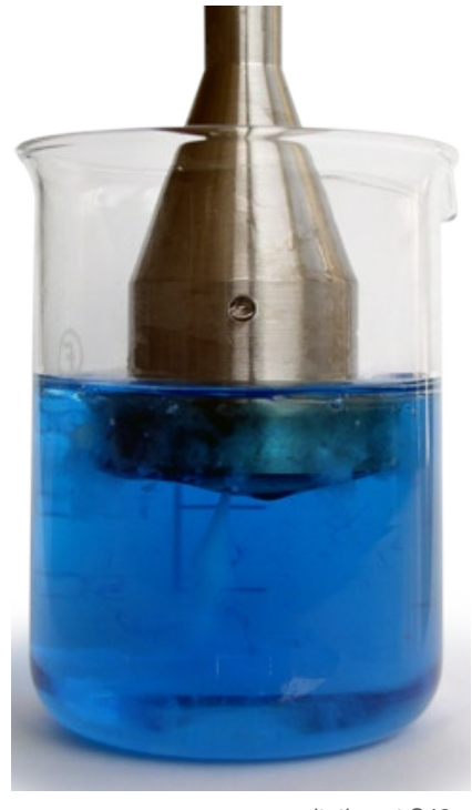
cavitation at S40

The ultrasonic processor UP200S (200 watts, 24kHz) differs from the UP200H only with its shape and its use only with stand.