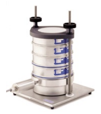
ultrasonic sieving in the laboratory