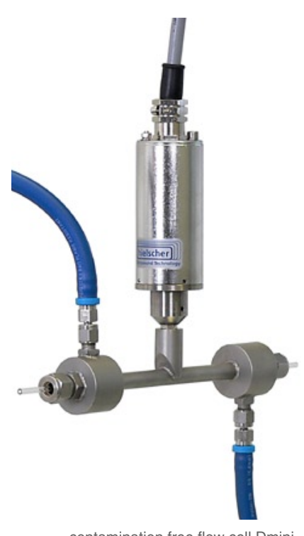
contamination free flow cell Dmini

For our ultrasonic processors we offer flow cells made of glass or stainless steel. The liquid to be sonicated is led in from below and passes through the cavitation zone under the sonotrode. appropriate sonotrodes The equipped with O-rings, that are fitted closely to the cell wall or the PTFEadapter. For higher pressures and temperatures the sonotrodes may be equipped with metallic oscillating-free flanges that are mounted to the stainless steel flow cells. The selected flow rate corresponds to the energy input required. The temperature of the medium can be influenced by means of a cooling jacket. Special designs of the flow cell, e.g. several supply connectors when emulsifying, are manufactured according to the demands of the customer. A new product in our product range is the mini flow cell (patent pending). When using this mini cell, the medium is hermetically sealed, so that the sonication can be realized without contamination.