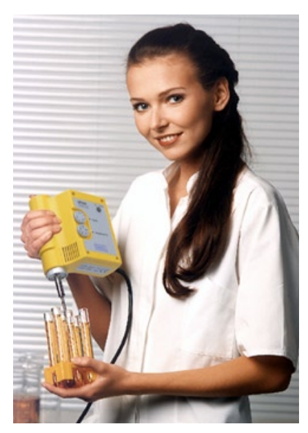
UP100H with MS3

For continuous operation only a flow cell and the appropriate 7mm sonotrode is required. Continuous processes in the smallest scale can be simulated. The optional PC-control may be helpful, if a test record is necessary or to optimize processes.