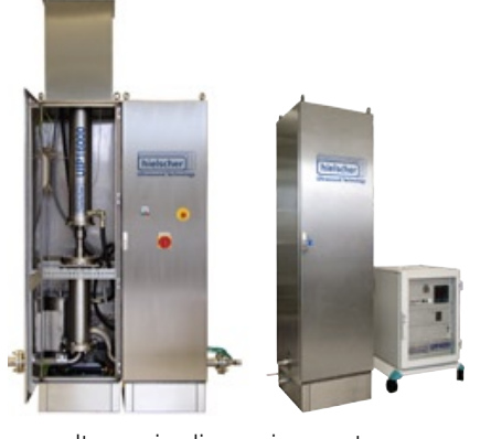
ultrasonic dispersing systems