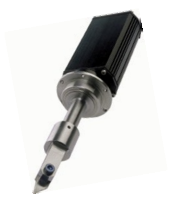
cutting and welding