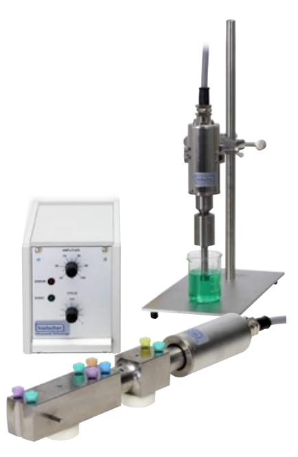
VialTweeter (front) and sonotrode (back) at ultrasonic processor UIS250v

The VialTweeter can be cleaned and disinfected easily. The VialTweeter is autoclavable and the transducer of the UIS250v is made of stainless steel (IP65, NEMA4). The generator is connected to the transducer by a 4m connection cable. Alternatively to the VialTweeter, the UIS250v can be equipped with sonotrodes for direct immersion into liquids. In that way, the UIS250v can be used as a hand-held or stand-mounted homogenizer.