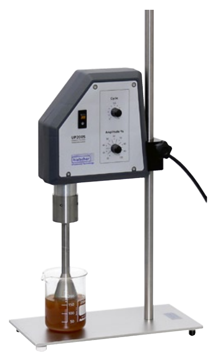
UP200S with S40

As all our laboratory devices the UP200S finds its customers world-wide. Without any additional fees we supply our devices for local power supplies from 100 to 240V and with the corresponding plugs.