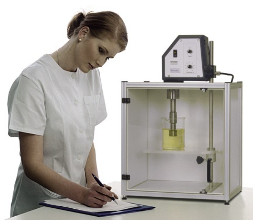
UP400S with H22 in sound protection box

The ultrasonic processor UP400S (400 watts, 24kHz) is our most powerful laboratory device. With sonotrodes of a diameter range from 3 to 40mm the device is suited for sample volumes from 5 to 4000ml. In flow approx. 10 to 50 liters per hour can be treated. For the preparation of test portions the UP400S is mainly used for bigger volumes. It is suited for the practical process development in the laboratory but also in the college of technology as well as for the production of small quantities. For production quantities a PC-control or a connecting lead to a central control of the user's plant is recommended in order to raise the process safety. With special flow cells and flange connections liquids can also be sonicated at high temperatures and pressures.