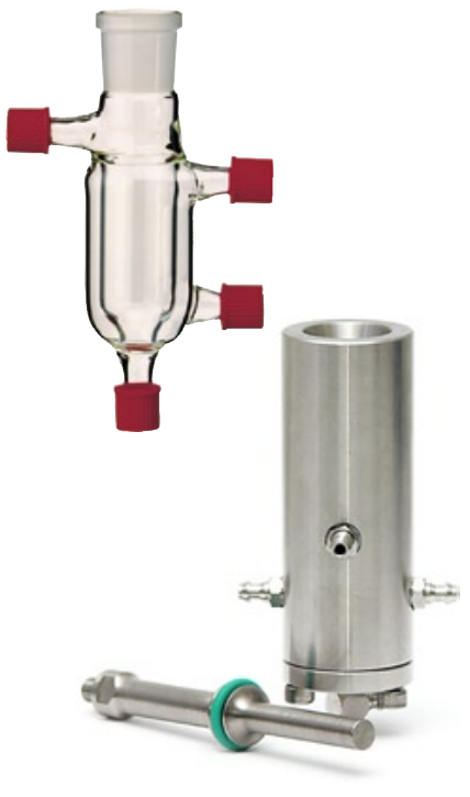
flow cells GD7K and D7K

The ultrasonic processor UP100H (100 watts, 30kHz) has the same dimensions as the UP50H but it is suited for the double power output. With the use of the 10mm sonotrode the field of applications expands to applications with volumes of up to 500ml.