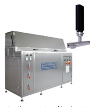
wire-, tape- and profile cleaning