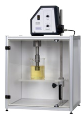
ultrasonic laboratory processors