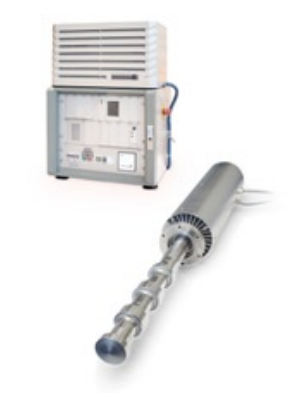
ultrasonic industry processors