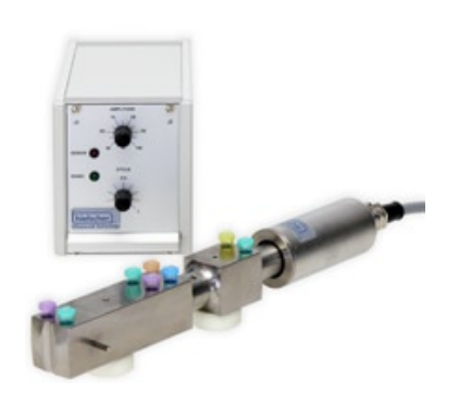
sonication of closed vials