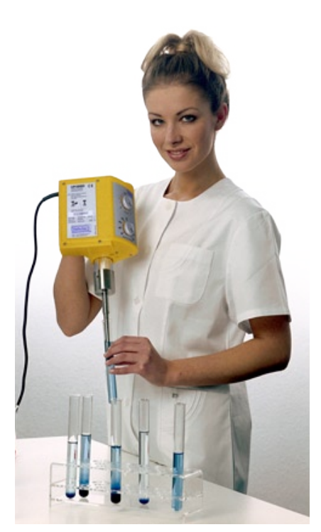
UP200H with S7

We offer a comprehensive range of accessories for the UP200H such as flow cells, stand, sound protection box, timer and PC-control.