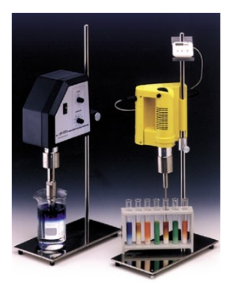
UP400S and UP200H with timer

As desk-space in the laboratory is expensive we supply ultrasonic processors in a compact design: Power supply, generator, control and transducer, all of which are located in an aesthetic housing. No additional cables impede.