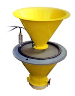
industrial ultrasonic sieving