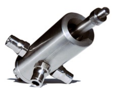
stainless steel flow cell D7K with MS7D