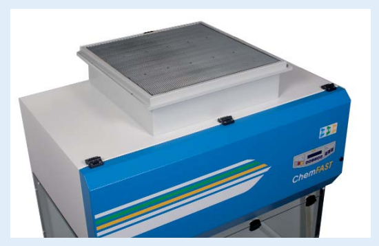
Additional filter housing re-circulating type