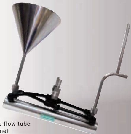
Jacketed flow tube with funnel