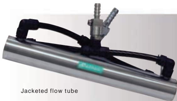
Jacketed flow tube