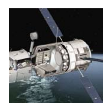
Air and space travel