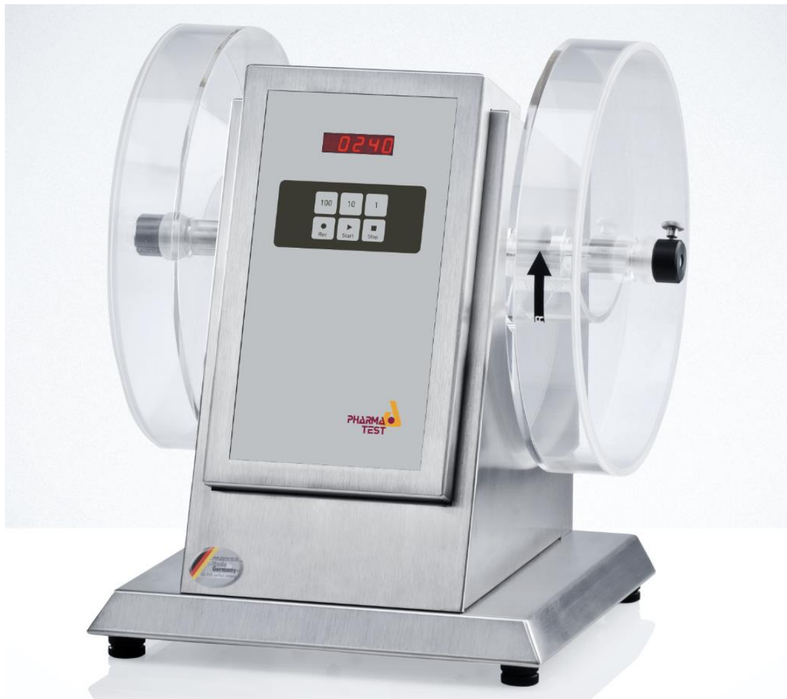
PTF 20E double-drum Tablet Friability Test Instrument

The PTF 20E is a double-drum tablet friability test instrument with fixed speed is manufactured in compliance to the USP <1216>, EP <2.9.7> and other Pharmacopoeias. This version is available as single or dual drum instrument.