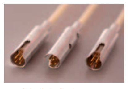
"plug & play" rod connectors