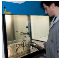
AIR FLOW SPEED TEST