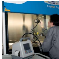
FILTER LEAKAGE TEST