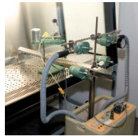
KI DISCUS TEST

Vertical and horizontal laminar flow cabinets are tested in accordance to ISO 14644-1 and EN 61010:2001 Standards and released with FAT certificate of the tests performed.