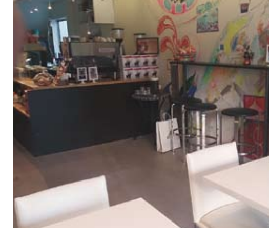
SUNSHINE STATE ESPRESSO

1-34-7 Honjo, Sumida-ku, Tokyo Japan TEL: 81-3-6456-1806 http://sunshinestateespresso.com