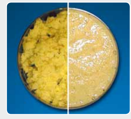
The picture shows a comparison between the degree of size reduction of raw potatoes homogenized with a household mixer (left) and the GRINDOMIX GM 200 (right)