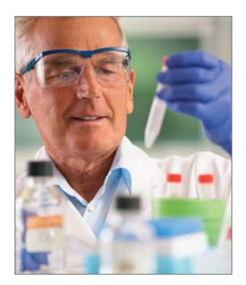
Pharmaceutical and chemical industry