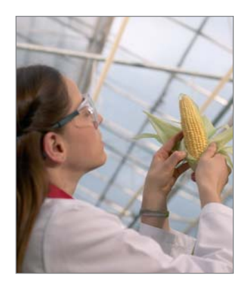
Food, feed and beverage industry

Cosmetics - creams, lotions, balm and oils.