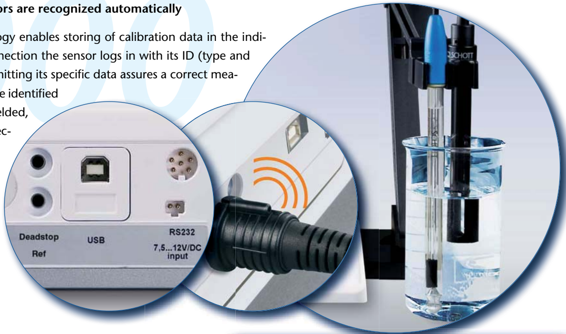
pH combination electrode A 161 ... ID

The latest microtechnology enables storing of calibration data in the individual sensor. Upon connection the sensor logs in with its ID (type and serial no.), and by transmitting its specific data assures a correct measurement. The sensors are identified unmistakably via a shielded, short-range radio connection. No input is needed. Even two sensors side by side can be identified unequivocally.