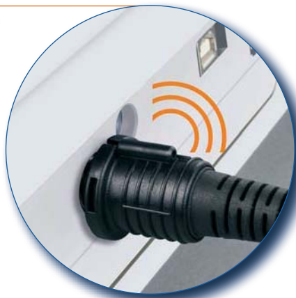
Wireless sensor recognition