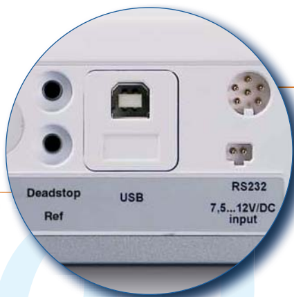
USB and RS 232 interfaces

The integrated dead stop function increases the operation area also for manual titration tasks. (wine industry, food industry).