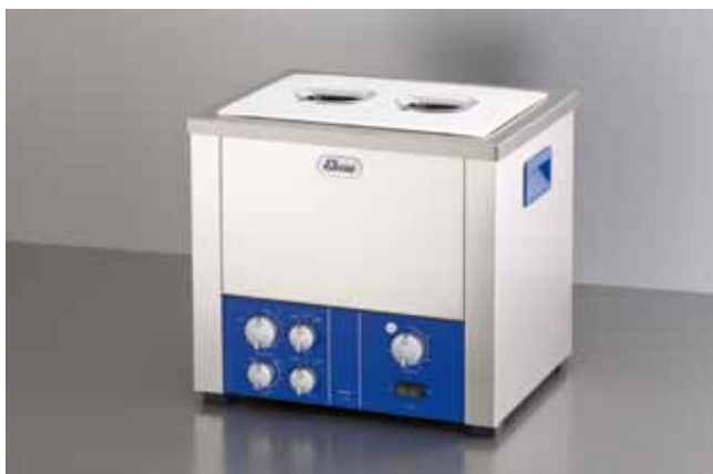
Elmasonic TI-H 10 with multi-frequency technology 25/45 kHz and cover with holes