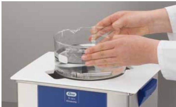
Cover with hole, made of PP

The right equipment for correct analyses