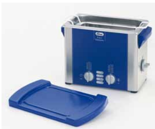
Elmasonic S 30 with basket and cover