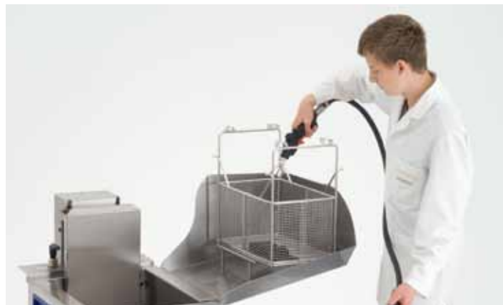
Elmasonic X-tra pro Flex 1 with shower rinsing device