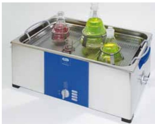
Elmasonic S 150 specialised laboratory Elmasonic S unit