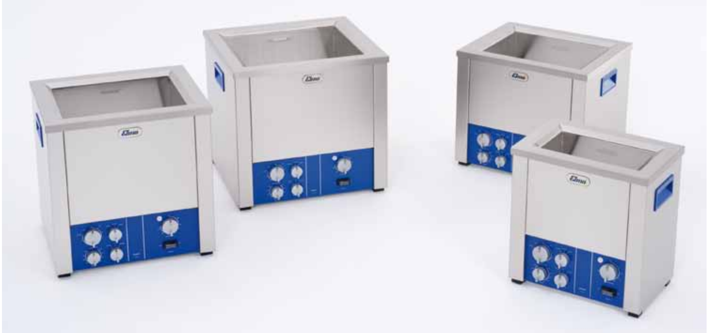
Elmasonic TI-H units with multi-frequency technology available in 4 different sizes

Specialised Elma units for the multiple requirements in terms of power, permanent operation or different frequencies in the industrial laboratory and for simulation purposes in the technical centre