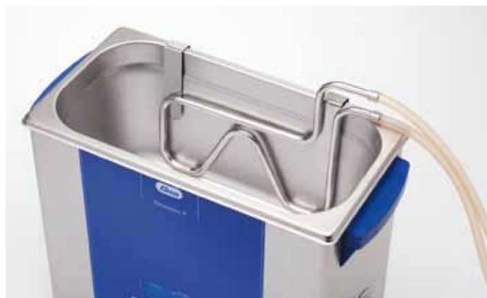
Elmasonic P with cooling coil

The cooling coil can be easily mounted into any of the Elmasonic S or P units. It takes less than 10 seconds to fit it into the tank between the basket and the tank wall. For larger tanks, two or more cooling coils can be combined. The cooling coils is connected to a customer-provided laboratory cryostat or to the tap water system.