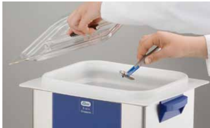
Elma plastic tub, made of PP