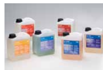
elma lab clean cleaning solutions Solutions for the laboratory see page 9

The use of Elmasonic ultrasonic units combined with elma lab clean chemicals guarantees a high degree of efficiency and excellent environmental compatibility.