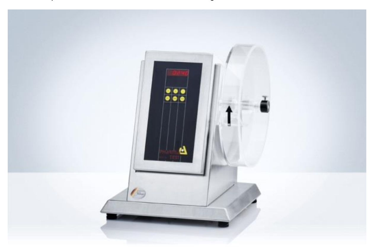
PTF 10E single-drum Tablet Friability Test Instrument

The PTF 10E single-drum tablet friability test Instrument with fixed speed is manufactured in compliance to the USP <1216>, EP <2.9.7> and other Pharmacopoeias. This version is available as single or dual drum instruments.