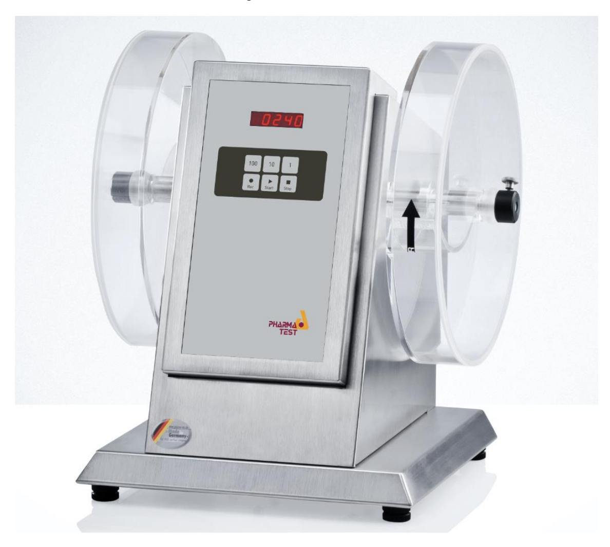
PTF 20E double-drum Tablet Friability Test Instrument

The PTF 20E is a double-drum tablet friability test instrument with fixed speed is manufactured in compliance to the USP <1216>, EP <2.9.7> and other Pharmacopoeias. This version is available as single or dual drum instrument.